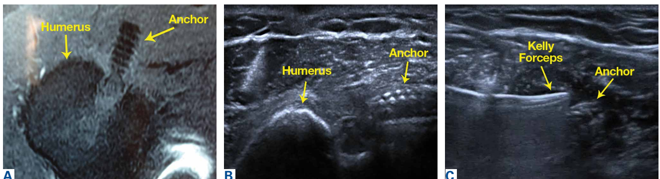
Figure 1. (A) Axial magnetic resonance imaging of the left shoulder. Biceps groove with biceps anchor pulled out from socket and loose. Yellow arrows indicate humerus and anchor. (B) Short axis ultrasound image of the left shoulder. Biceps groove with biceps anchor pulled out from socket and loose. Yellow arrows indicate humerus and anchor. (C) Ultrasound image of the left shoulder. Kelly forceps reaching for anchor to remove it. Yellow arrows indicate forceps and anchor.

Being able to identify specific structures in